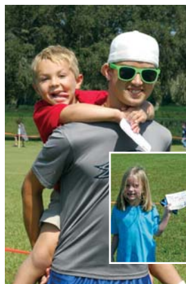
Geneva students raised over $20,000 for their school through Walk-a-Thon in October.